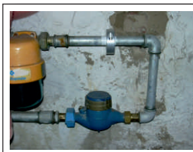
Installation example in the private sector

The Sialex ® Ring - installed directly after the water meter, the ring can develop its effect optimally and for a long time.